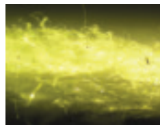
Synthetic Media 0.0285 inches thick

At .0285 inches of thickness, the synthetic media shown on the left is 1.5 times thicker than the cellulose blend on the right.